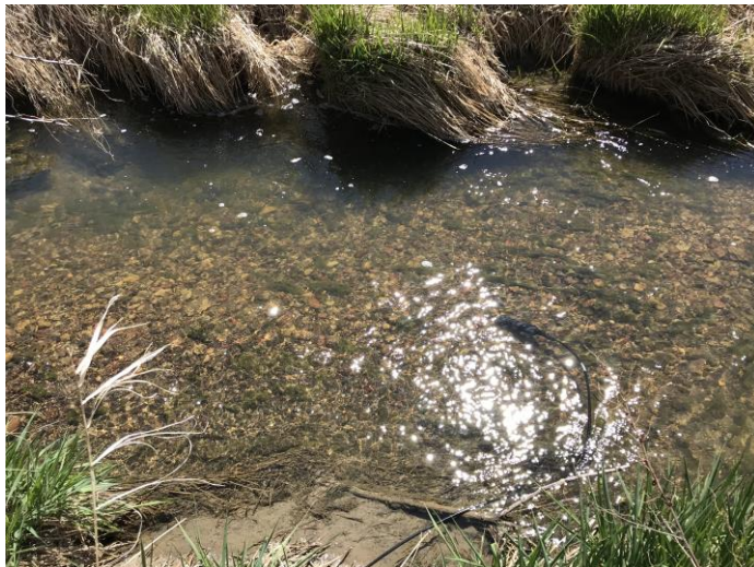
Photo 11. Across from Mill Coulee Site.