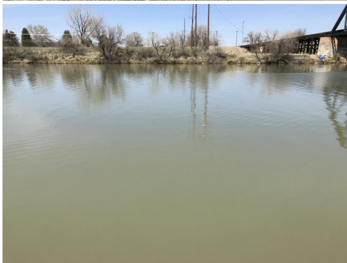
Photo 20. Across from Great Falls Site.