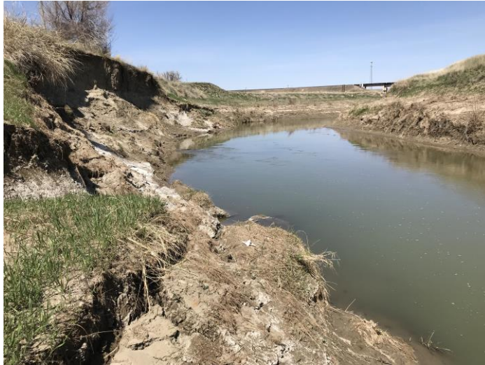
Photo 13. Upstream at Muddy Creek Site.

GPS Coordinates: 47.561056 latitude -111.538306 longitude