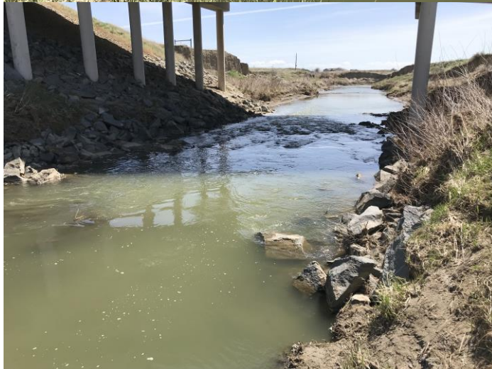
Photo 15. Downstream at Muddy Creek Site.