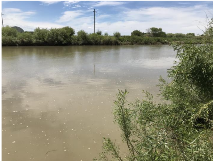
Photo 16. Upstream at Vaughn-Ulm Bridge Site.

GPS Coordinates: 47.547258 latitude -111.531208 longitude