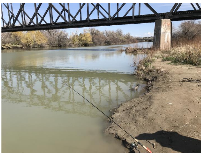
Photo 21. Downstream at Great Falls Site.