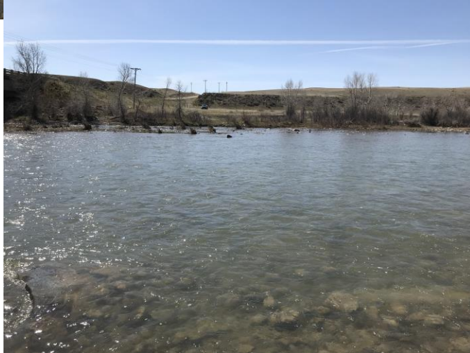
Photo 2. Across from Augusta Site.