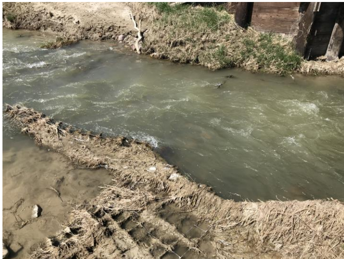
Photo 5. Across at Big Coulee Site.