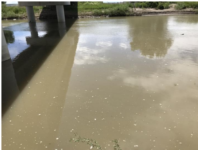
Photo 17. Across at Vaughn-Ulm Bridge Site.