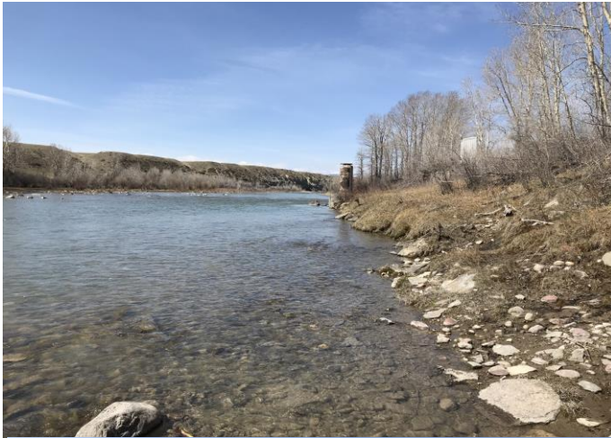
Photo 1. Upstream at Augusta Site.

GPS Coordinates: 47.547861 latitude -112.36635 longitude