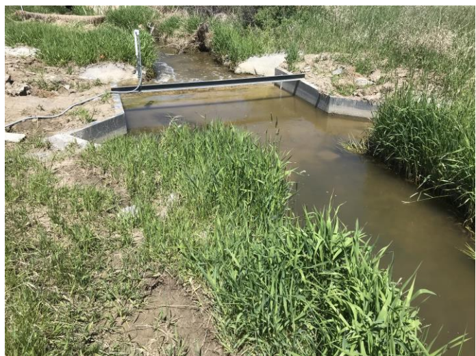
Photo 9. Downstream at Adobe Creek Site.