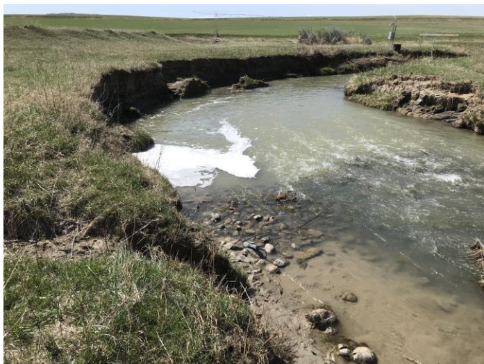
Photo 6. Downstream at Big Coulee Site.