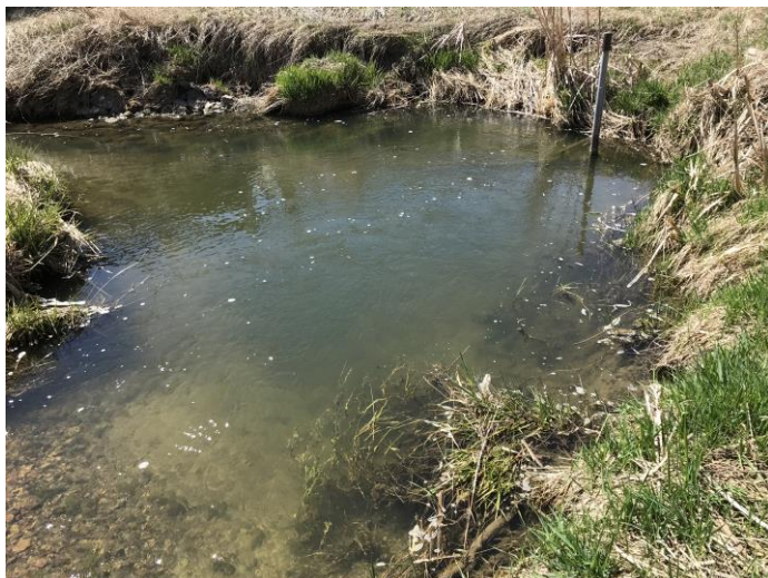
Photo 12. Downstream at Mill Coulee Site.