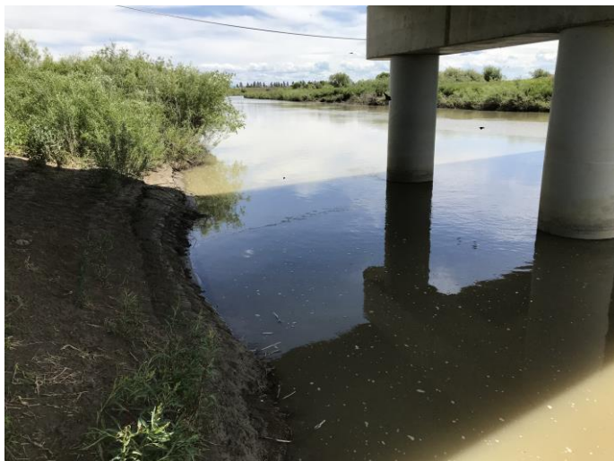
Photo 18. Downstream at Vaughn-Ulm Bridge Site.