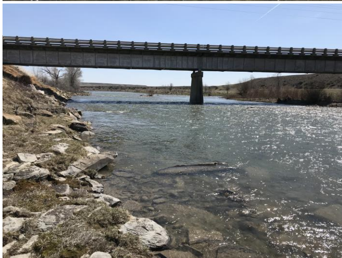
Photo 3. Downstream at Augusta Site.