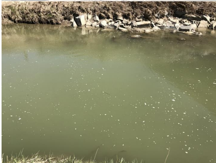
Photo 14. Across from Muddy Creek Site.