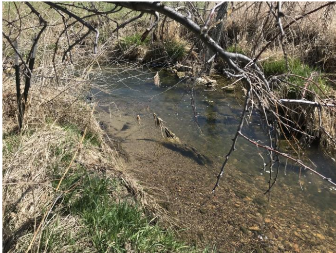
Photo 10. Upstream at Mill Coulee Site.

GPS Coordinates: 47.540611 latitude -111.705806 longitude