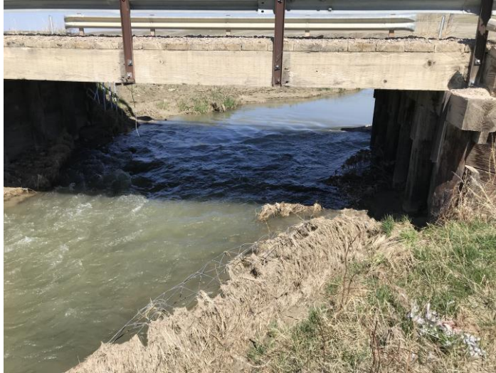
Photo 4. Upstream at Big Coulee Site.

GPS Coordinates: 47.516972 latitude -111.887306 longitude