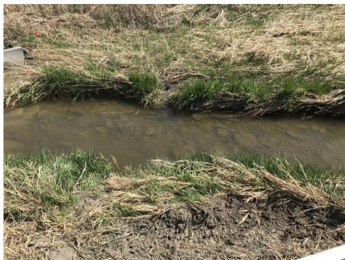
Photo 8. Across at Adobe Creek Site.