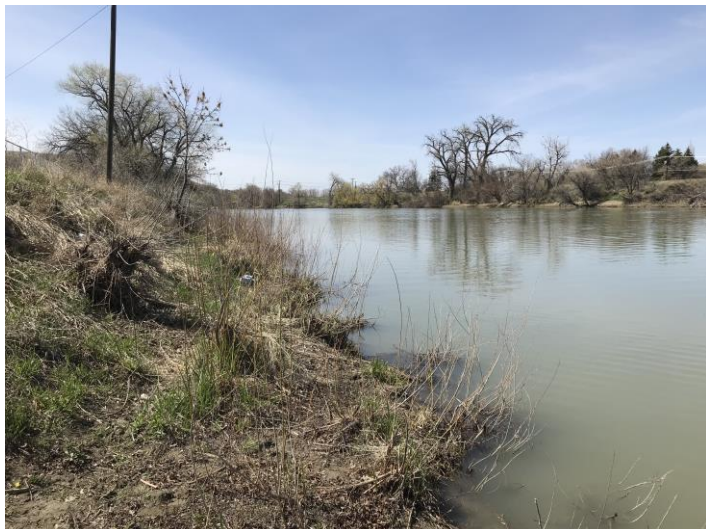
Photo 19. Upstream at Great Falls Site.

GPS Coordinates: 47.492028 latitude -111.334361 longitude