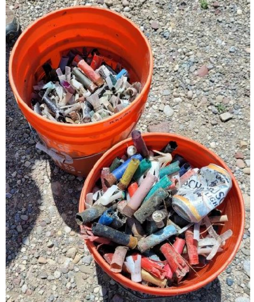
Photo: Trash and ammo collected at Freezeout Lake Spent Ammo pickup event